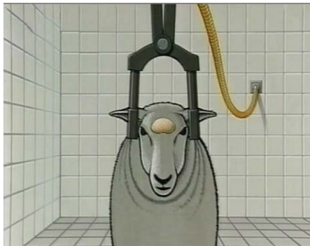
Electrode position (front view)