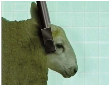
Electrode position (side view)