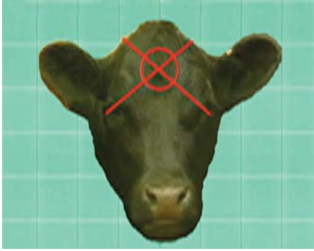
Penetrative captive-bolt position (front view)