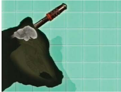
Penetrative captive-bolt position (side view)